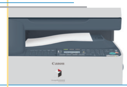
Integrated Output Trav

Plug-and-play connectivity is provided via a standard USB 2.0 Hi-Speed interface for optimal performance. Best of all, each model can be fully networked so you can extend system capabilities to multiple users (optional for the Canon imageRUNNER 1025 model).