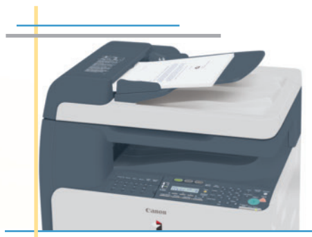
Duplexing Automatic Document Feeder