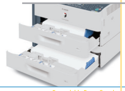
Expandable Paper Supply